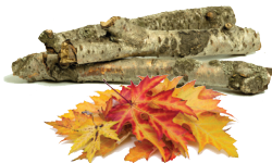
Leaves, brush, Christmas trees, and yard debris