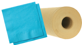
Paper towels, napkins, and shredded paper