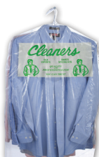
Dry cleaning bags