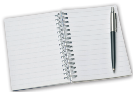
Notebooks with metal or plastic binding attached