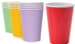
Plastic and paper cups

The following items are NOT accepted for recycling and should be disposed of with household trash.