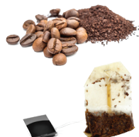
Coffee grounds, filters, and tea bags