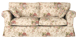
Furniture, mattresses, and carpets