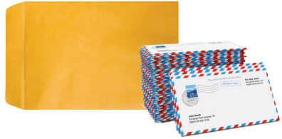
Envelopes and junk mail