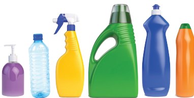
Plastic bottles, jugs, tubs, and lids