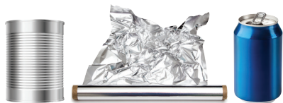
Empty food cans and aluminum foil