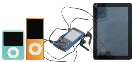
MP3 players, iPods, tablets, and iPads