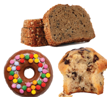
Cereal, bread, and baked goods