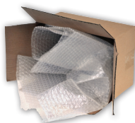
Bubble wrap and shipping pillows