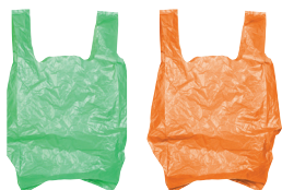
Plastic shopping bags

Accepted materials must be CLEAN and DRY.