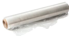
Clean plastic wrap