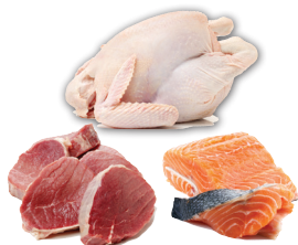
Meat, poultry, and seafood products