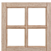
Window and auto glass