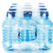
Case wraps (ex. around water bottles)