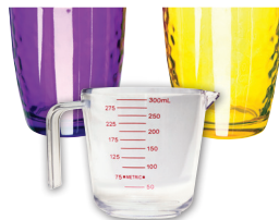
Drinking glasses and tempered glassware (Pyrex)