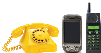
Telephones and cell phones

Deposit these items in the electronics recycling area at the Transfer Station.