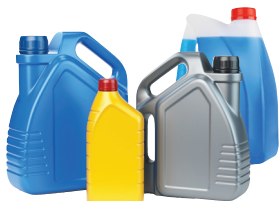
Automotive fluid containers