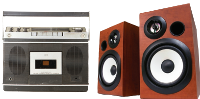
Stereos/radios and speakers