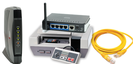
Cables/IT accessories, routers/ modems, and gaming consoles