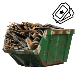
Construction and demolition debris