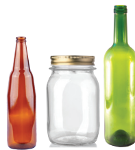
Glass bottles and jars (all colors)