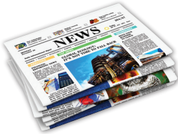
Newspapers, magazines, and store flyers