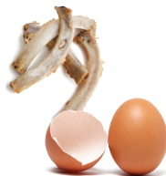
Eggshells, bones, and shellfish