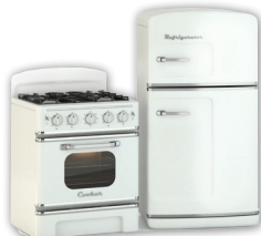
Appliances (small and large) and scrap metal