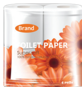
Bath tissue and paper towel wrap