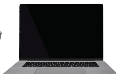
Computer tower/desktop, printers, and laptops