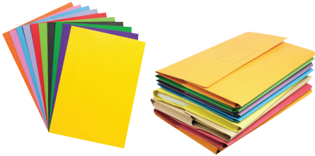
Office paper (white and colored) and file folders