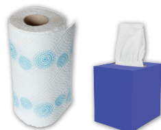
Paper towels or facial tissue