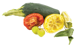
Food and organic waste (composting)