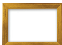
Picture frame glass