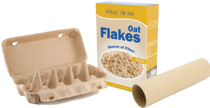
Box board (cereal boxes, paper egg cartons, empty rolls, etc.)