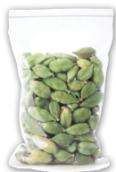
Zip-type food storage bags