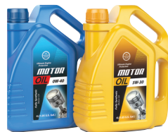
Used motor oil