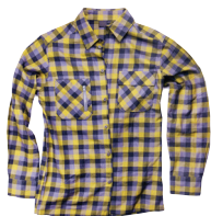
Gently used clothes and other textiles