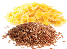
Pasta, rice, and other grain products