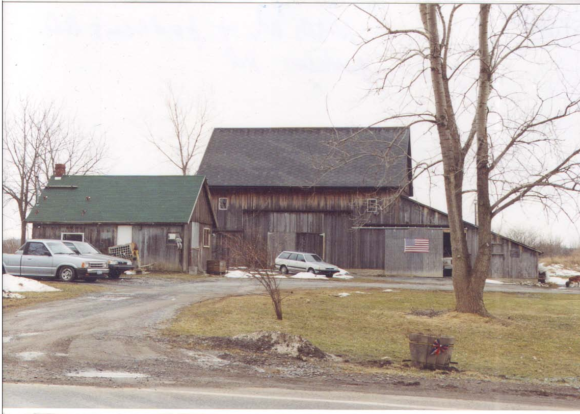
Remaining Andrews Farm Buildings in 2010, looking from the north. The milk processing/bottling building is the barn on the left.